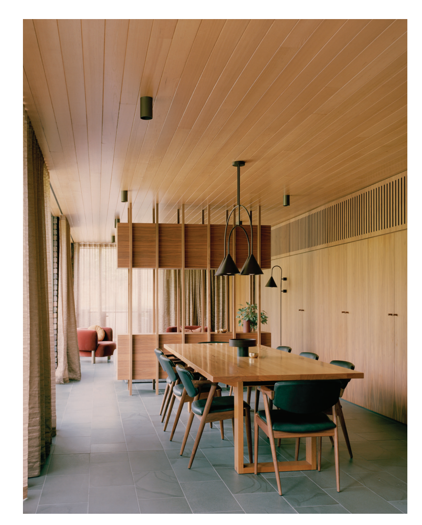
Mansard House is a striking mix of contemporary vision and retro sensibility.

Studio Bright's vision for Mansard House was a delicate balance between contemporary flair and retro sensibilities. Open living spaces, while ideal for embracing views, required thoughtful division to avoid a cluttered aesthetic. Studio Bright achieved this by introducing divider elements, preserving distinct qualities within the expansive rooms. "Remnants of an existing brick wall between the kitchen and dining room, as well as a floating joinery piece between the dining room and lounge, make the rooms feel like separate spaces," says Melissa.